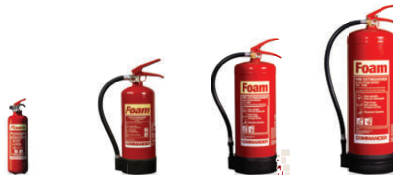
1ltr AFF Foam