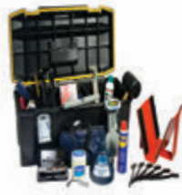
Engineer's Tool Kit (Advanced)

1KG SPRING BALANCE 20KG SPRING BALANCE TG HEADCAP SPANNER BRITANNIA 'C' SPANNER ALLEN KEYS ADJUSTABLE SPANNER GLORIA HEADCAP 'T' BAR FIREPOWER HEADCAP 'T' BAR GAUGE TESTER MIJA STANDARD ENGINEER'S TORCH RUBBER MALLET NYLON VALVE BRUSH BRASS VALVE BRUSH 200ML WD40 'O' RING REMOVAL TOOL PETROLEUM JELLY 200G POWDER BLOW OUT BAG