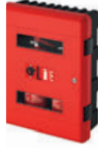
Commander Double Lockable Cabinet