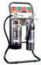
Double Tubular Stand