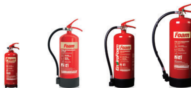
2ltr AFF Foam