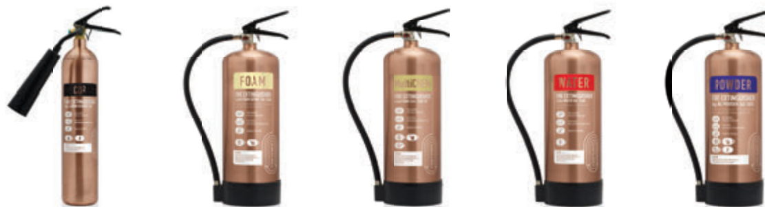
2kg CO2 Brushed Antique Copper