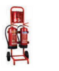
Compact Double Trolley

CAN BE ADAPTED TO HOLD CO2 FIRE EXTINGUISHERS