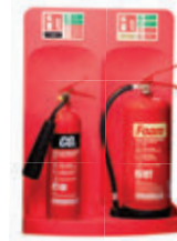
Commander Double Extinguisher Stand