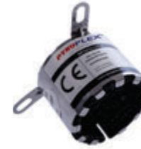
Collars and Wraps

For easy installation in walls and fire doors, intumescent grilles allow ventilation where required and form a barrier to prevent the spread of smoke and fire. Grilles are used to provide fire dampers in ductwork.