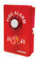
Commander Alert Site Alarm

Manually raise the alarm in times of emergency to ensure all users of the building are made aware they should vacate.