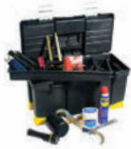
Engineer's Tool Kit (Standard)

Provide support to vital fire safety equipment with our extensive selection of ancillary products, which are fully compliant with British Standards.