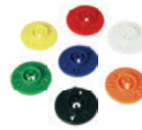
Chubb Type Pin and Discs

SELF LOCKING SEAL NO TOOLS REQUIRED PROTECTS AGAINST TAMPERING AND ACCIDENTAL DISCHARGE 10 SEALS PER MAT