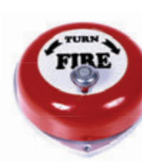
Rotary Alarm Bell

CODE AE23 WEIGHT 115G DIMENSIONS (ØD) 140 X 35.5MM ALARM SOUND LEVEL 85DB BSI KITEMARKED EN50291 BATTERY OPERATION 3 X AA ALKALINE BATTERIES SUPPLIED AS STANDARD WARRANTY 5 YEARS TEST/RESET BUTTON TO ALLOW REGULAR TESTING OF ALARM FUNCTION