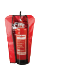
PVC Extinguisher Cover (Medium)