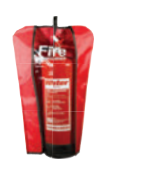
PVC Extinguisher Cover (Large)

VELCRO STRAPS TO ALLOW FOR EASE OF FITTING AND SECURING