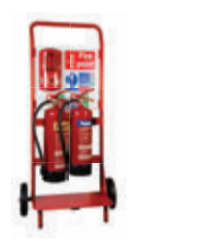
Backboard Double Trolley