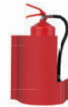
Wave Wall Extinguisher Stand