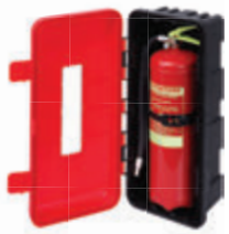
Single Commander Cabinet

Safely store fire extinguishers in a cabinet that protects against accidental damage, misuse and all-weather conditions.