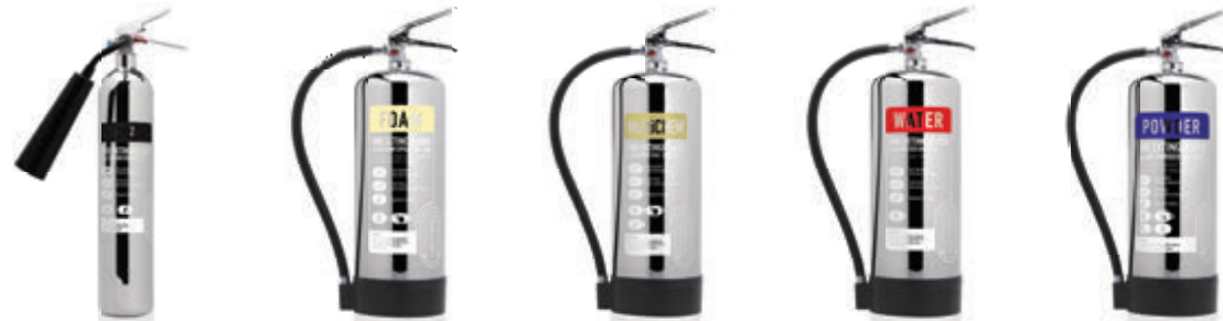
2kg CO2 Stainless Steel