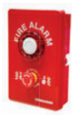
Commander Alert Site Alarm Wireless

CODE AE25 WEIGHT 670G DIMENSIONS (WHD) 170 X 250 X 80MM* ALARM SOUND LEVEL 115DB 12 LED SUPER BRIGHT STROBE ABS CASE RESISTS SHOCKS AND DROPS SIMPLE FITTING AND OPERATION RADIO LINK MODULE AVAILABLE IP65 RATED *(INCLUDING ACTIVATION BUTTON AND STROBE/SIREN)