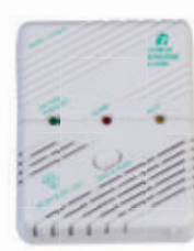
Carbon Monoxide Alarm

CODE AE15 WEIGHT 100G DIMENSIONS (ØD) 87 X 87 X 43MM ALARM SOUND LEVEL 85DB-110DB BATTERY OPERATION 6F22 9V BATTERY SIMPLE FITTING AND OPERATION SUITABLE FOR USE ON THE CS60 AND ALL CABINETS OF ALARM FUNCTION