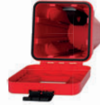
Vehicle Extinguisher Cabinet 6kg / 9kg