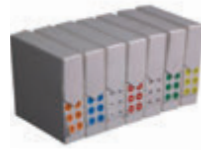
Year Gauge Indicator Dots

INCLUDES STANDARD ENGINEER'S TOOL KIT PLUS: DIGITAL SCALE MAGLITE® TORCH LED INSPECTION LAMP GAUGE TESTER EBUR WIKA LEAK DETECTOR SPRAY 'V' CLAMP PLASTIC FUNNEL