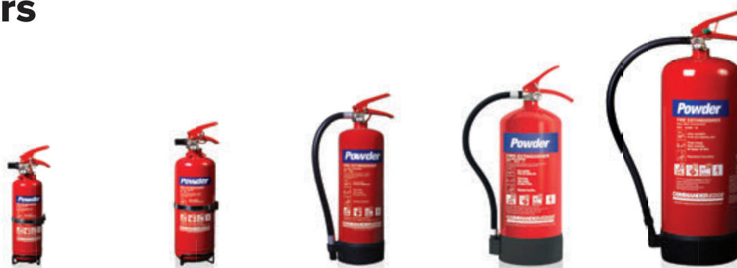
1kg ABC Dry Powder