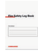
Fire Safety Log Book

SIZES 1 X 1M 1.2 X 1.2M 1.8 X 1.2M BLANKET MATERIAL SILICONE COATED FIBERGLASS FABRIC OUTER CASE MATERIAL PP CASE