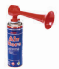
Air Horn Alarm

CODE AE01 WEIGHT 1.57KG DIMENSIONS (ØD) 274MM X 89.4MM ALARWM SOUND LEVEL 85DB SUITABLE FOR USE INDOORS AND OUTDOORS HAND-OPERATED FIRE ALARM BELL ALUMINIUM ALLOY