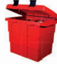
Commander Safety Box