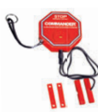
Commander Contact Alarm

CODE AE20 WEIGHT 130G DIMENSIONS (DH) 110 X 370MM ALARM SOUND LEVEL 85DB TECHNOLOGY IONISATION SMOKE SENSOR BATTERY TYPE 9V ALKALINE WARRANTY 5 YEARS CEILING INSTALLATION