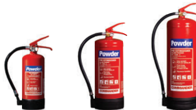
3kg ABC Dry Powder