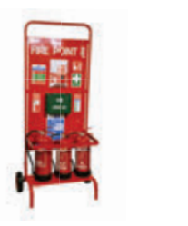
Mobile Fire Point Stand

A LARGE STEEL BACKBOARD FOR MOUNTING ALARM EQUIPMENT AND SIGNAGE