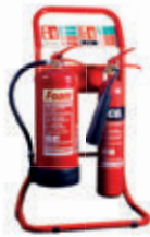
Double Tubular Stand