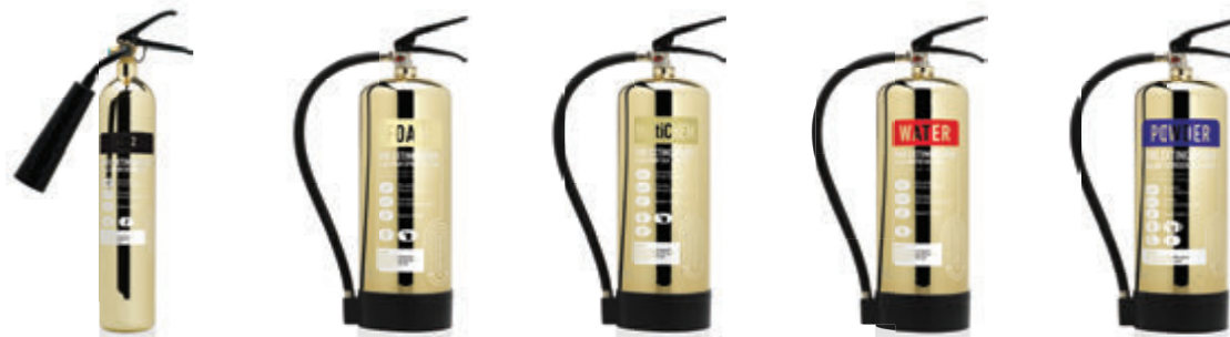
2kg CO2 Polished Gold