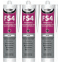
Mastic and Foam

Fire doors require automatic drop-down seals, which provide an effective barrier against climate, noise, light, fire, smoke and insects. Once the door is closed, a plunger-like system ensures the gap between the door and flooring is closed. Choose from a range of seals suitable for glass and timber doors.