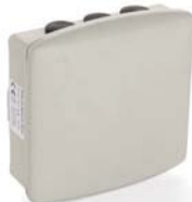
RCU1-KIT Control Unit (Radio)