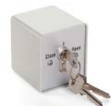
RRTKEY Key Switch