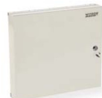
WCC 310 Control Unit