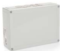
PSU - 2/4/8RC 24V DC Transformer (Radio)