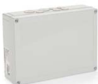
PSU - 2/4/8 24V DC Transformer