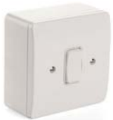
S50-1 Rocker Switch