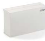
WUC 102 Control Unit