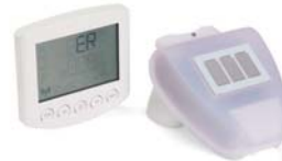
EVC Control Unit & Weather Station